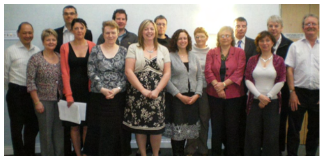
The FiCTION Trial Team - Newcastle, May 2009