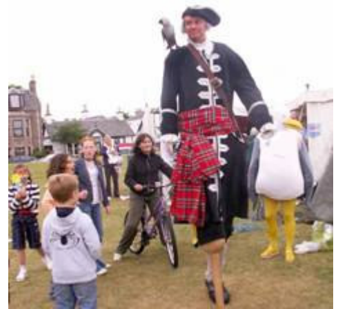
Long John Silver pays a visit!