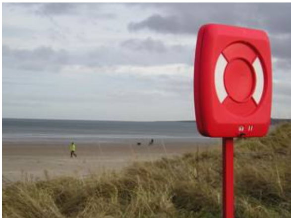
West Sands, St Andrews