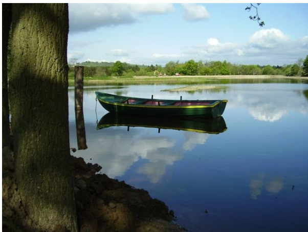
Thanks to Patricia Galfskiy, Tay Regeneration Project

The next phase is to convert the existing fishing bothy into a River Station; a base from where a River Steward can operate wildlife boat trips, guided walks & talks, also housing a heritage centre, tackle & coffee shop. The centre will be run from renewable energy sources. This next phase is subject to obtaining permission from the various statutory bodies.